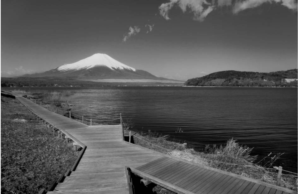
View of Fujisan from Lake Yamanakako