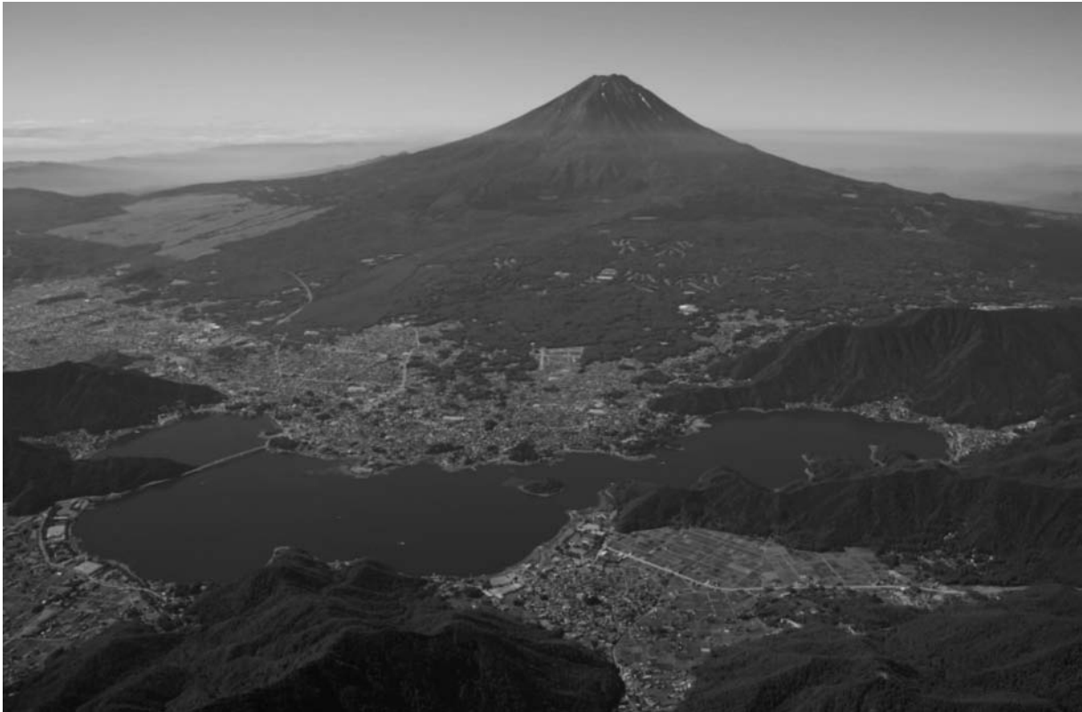
Aerial view of Fujisan from north