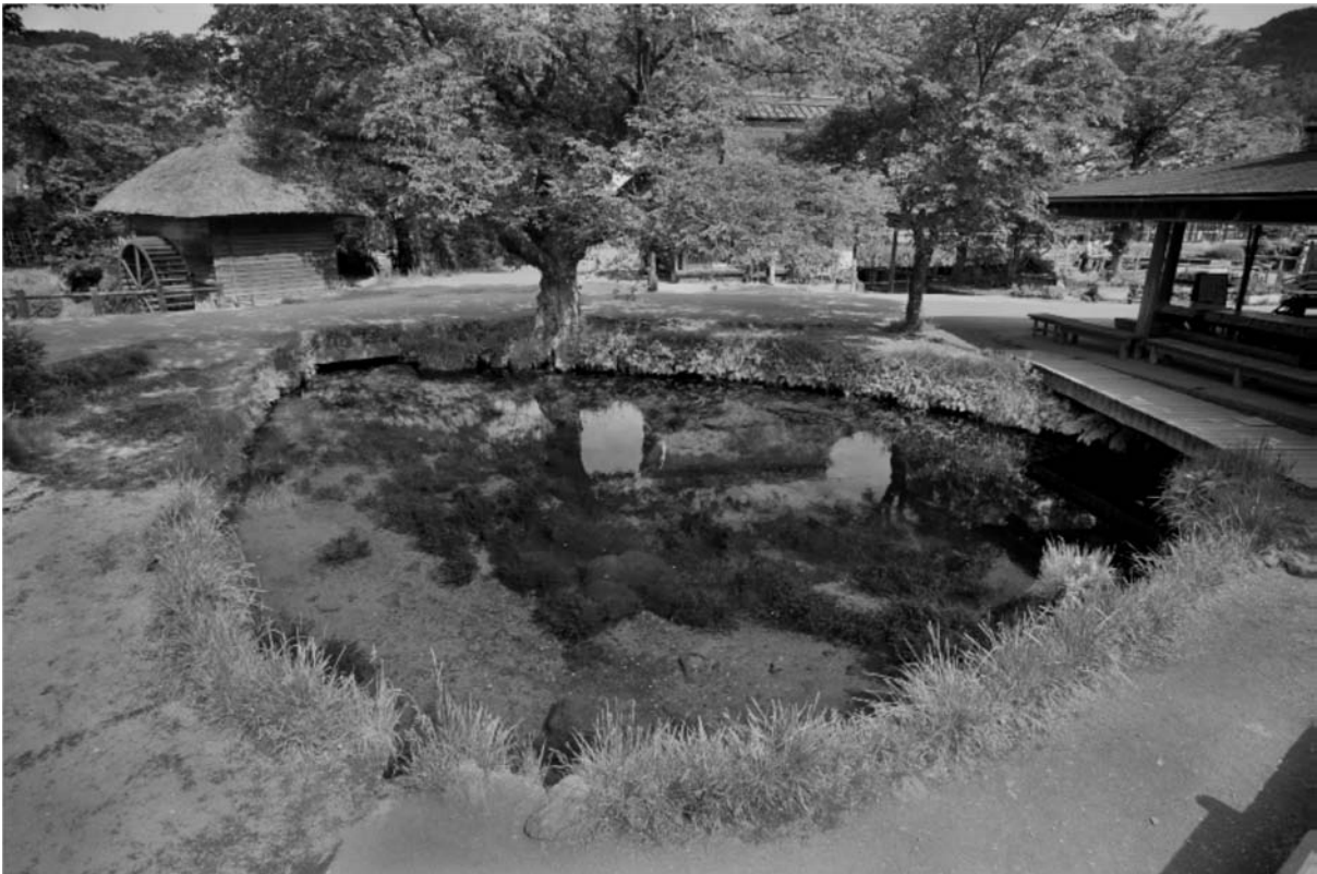
Oshino Hakkai springs (Wakuike Pond)