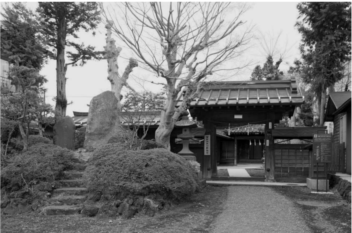
"Oshi" Lodging House (Former House of the Togawa Family)