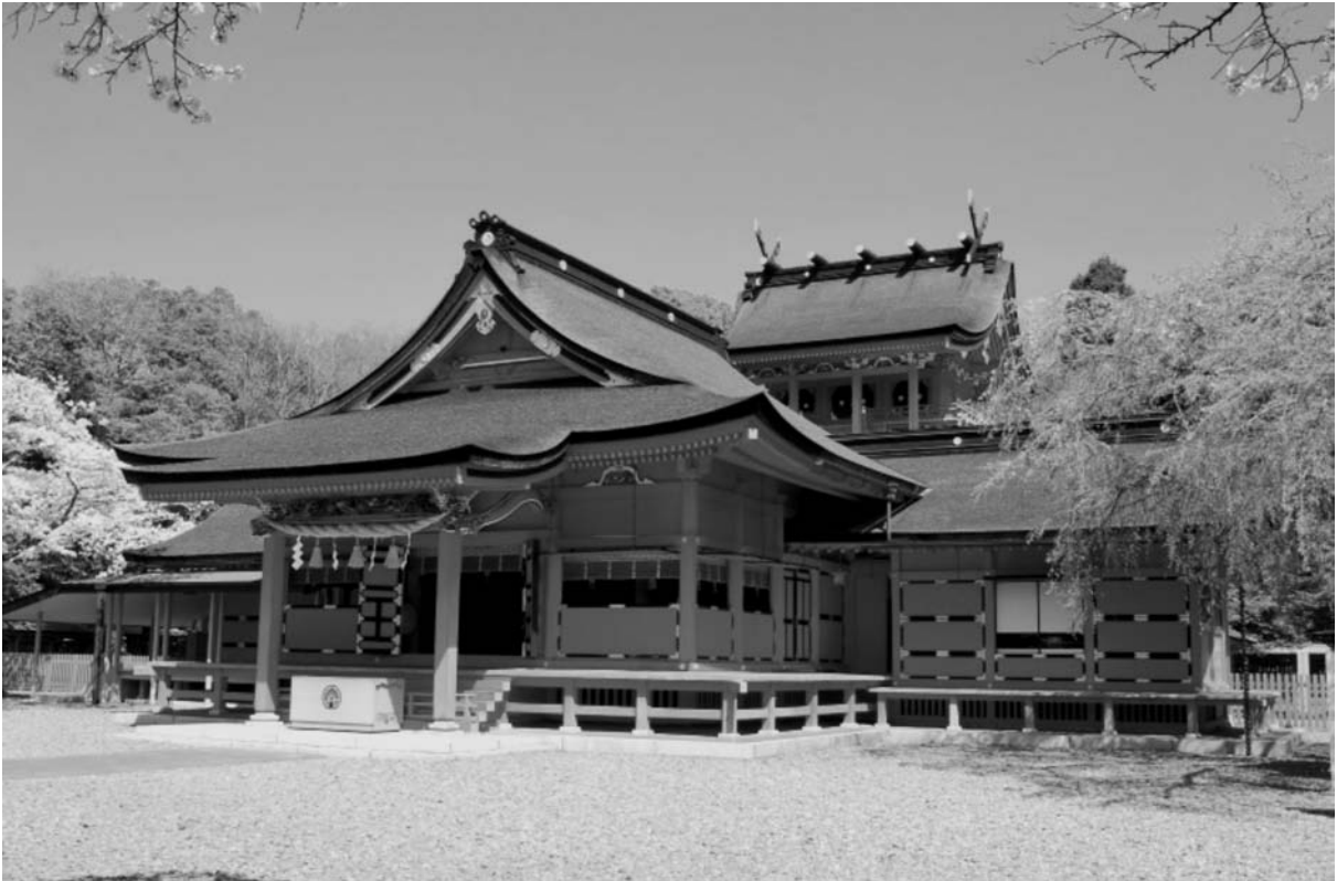
Fujisan Hongu Sengen Taisha Shrine