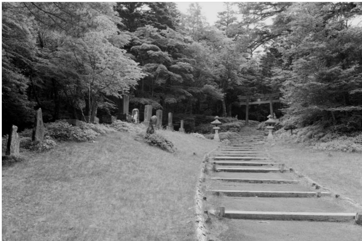
Yoshida ascending route